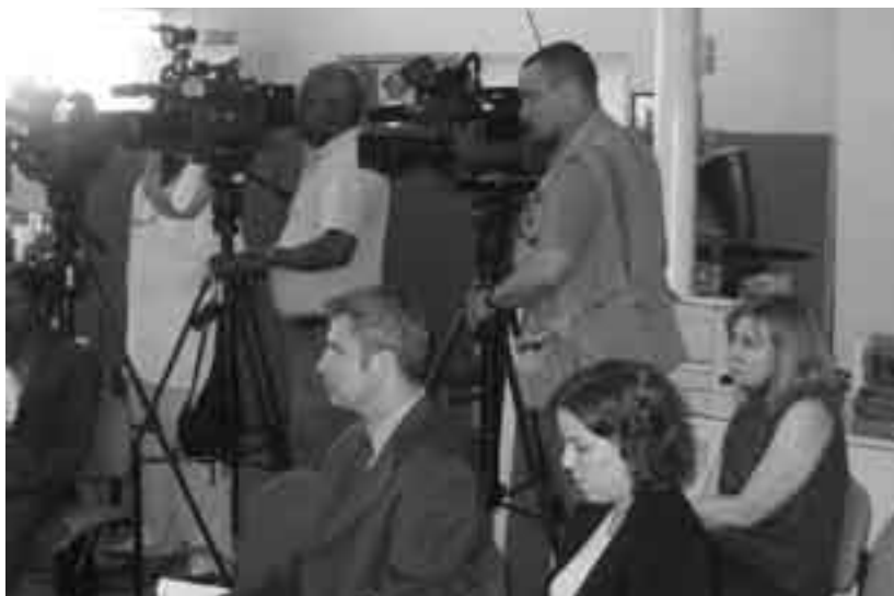
Cameras zoom in at NRS' April 18th press conference.

L aunch of the National Runaway Switchboard's (NRS) new 800 number, 1-800-RUNAWAY, struck a chord with media on April 18th attracting television and radio coverage of the press conference announcing the number. Congresswoman Jan Schakowsky (D-IL) joined NRS Executive Director, Maureen Blaha and NRS youth volunteer, Ari Jadwin at NRS headquarters to unveil 1-800-RUNAWAY to the American public. NRS also announced the establishment of a new url, www.1800RUNAWAY.org to match its new signature 800 number. "More than 1,200 youth in the United States run away from home each day," said Schakowsky. "Without organizations such as the National Runaway Switchboard, over a million youth each year would have nowhere to turn during a time of crisis."