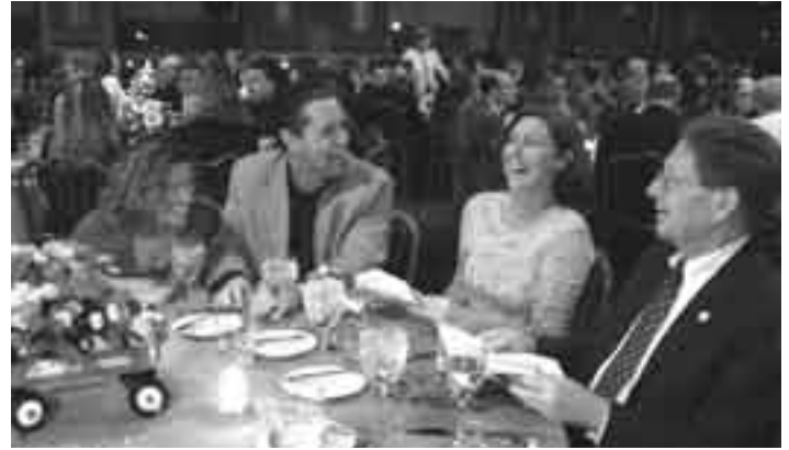
2004 guests enjoy the festivities at Spirit of Youth 2004.

*Be a Sponsor, Table Captain, Guest, Early Auction Bidder at www.1800RUNAWAY.org