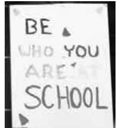
Poster carried at Day of Silence/Night of Noise celebration rally held around the country.

*U.S. Department of Health and Human Services, "Report of the Secretary's Task Force on Youth Suicide." 1989